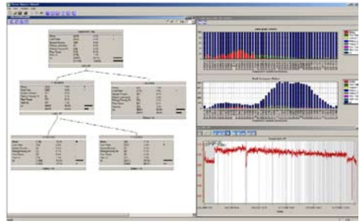
Decision tree, node brushing and pivot table analysis